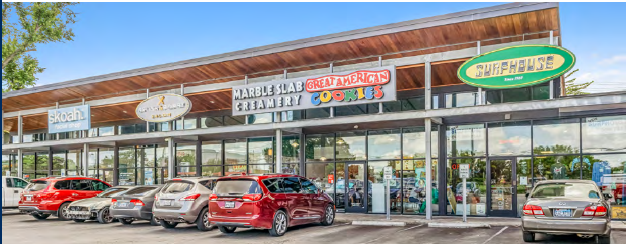
ELLA OAKS SHOPPING CENTER | 2